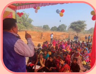
New churches and baptism services near the Panki area